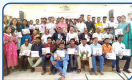
Annual Prize Distribution Program