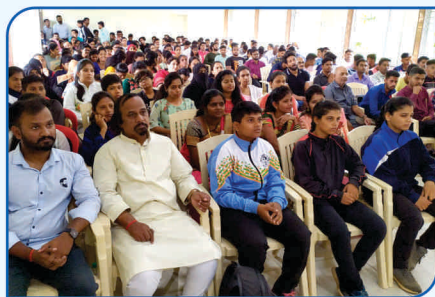
One Day Work Shop on Opportunities in Sports