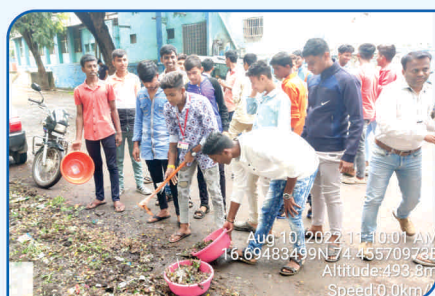
Cleanliness Campaign by NSS Students around College Campus