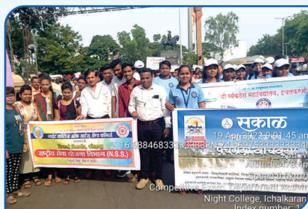
Participation in "Save Punchganga Rally" Organized by Daily Sakal