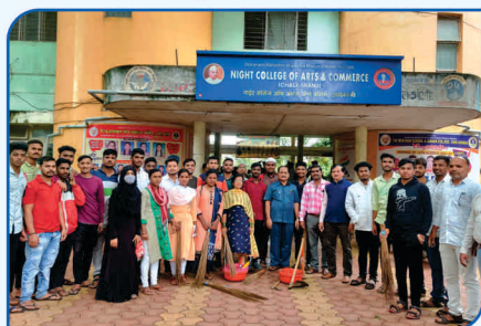
Cleanliness Campaign by NSS Students around College Campus