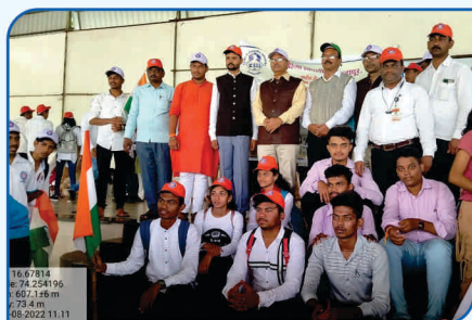
Closing Ceremony of "Swaraj Mahotsav" Organized by Shivaji University, Kolhapur