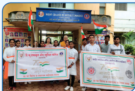
Rally on the occasion of "Swaraj Mahotsav"