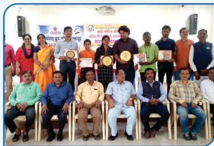
National Level Poetry Recitation Competition