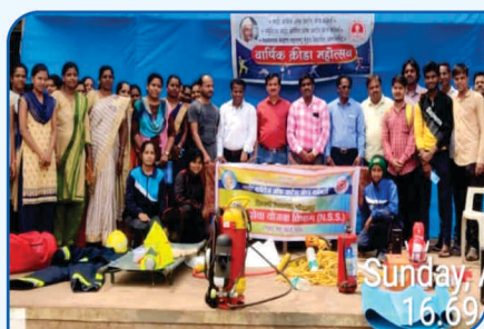
Training Session on Disaster Management Organized by Night College in Collaboration with Municipal Corporation